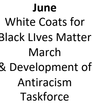
12 Departmenta Projects

"A consensus willingness to create c unified structure to tackle the problem in a unified manner." "We are missing cohesiveness."